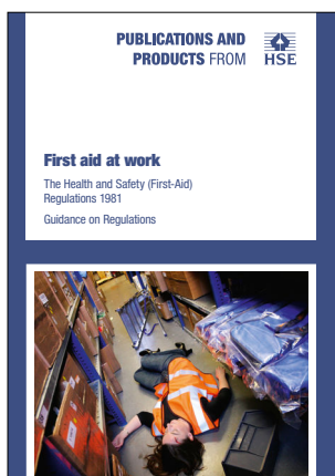
L74 (Third edition) Published 2013

This is a free-to-download, web-friendly version of L74 (Third edition, published 2013 – reissued with minor amendments in 2018 and 2024). This version has been adapted for online use from HSE's current printed version.